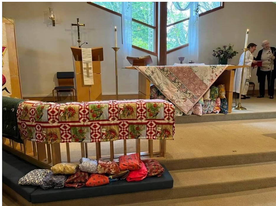
Quilts, Fabric Kits (on kneeling pad), Baby Care Kits (under altar) on display May 8 & 9

Rachel Circle meets at Bethany each Tuesday morning throughout the school year from 10 to early afternoon (flexible hours). Some Rachel Circle members will continue to gather during the summer months. Many caring hands go into this process, and newcomers are always welcome-even if sewing isn’t your thing!